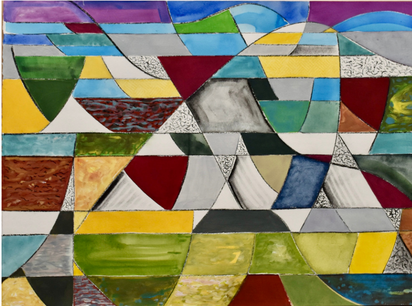
The Land, the Sea and Sky 2023 Mixed media on Fabriano paper 56 x 76.5 cm