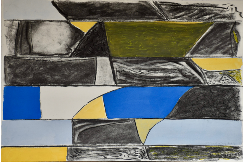
Landscape, Winter 2023 Mixed media on Fabriano paper 38.5 x 56 cm