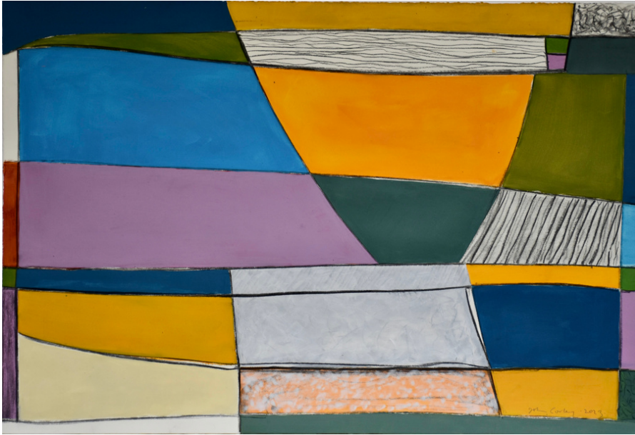
Stour Estuary from Pegwell I 2023 Mixed media on Fabriano paper 38.5 x 56 cm