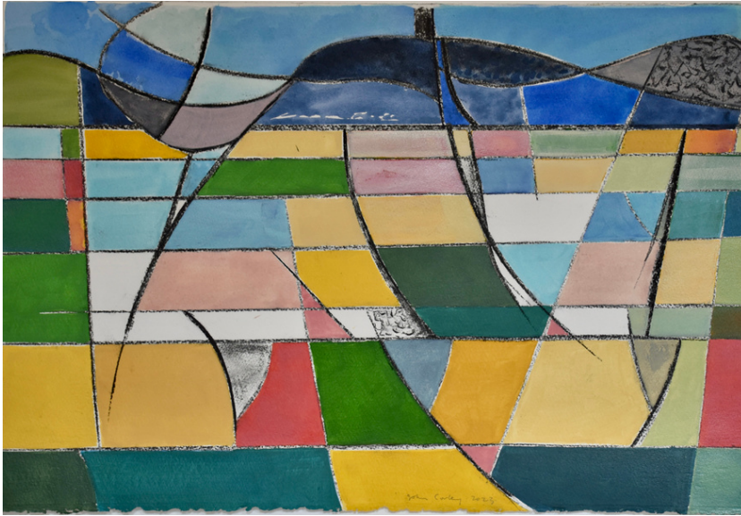
Summer Dawn 2023 Mixed media on Fabriano paper 38.5 x 56 cm