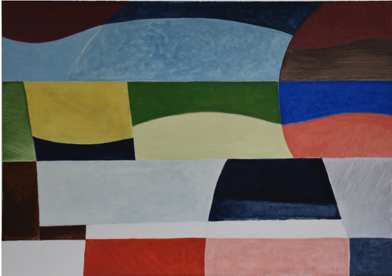
French Coast from St Margarets 2023 Mixed media on Fabriano paper 35.5 x 50 cm